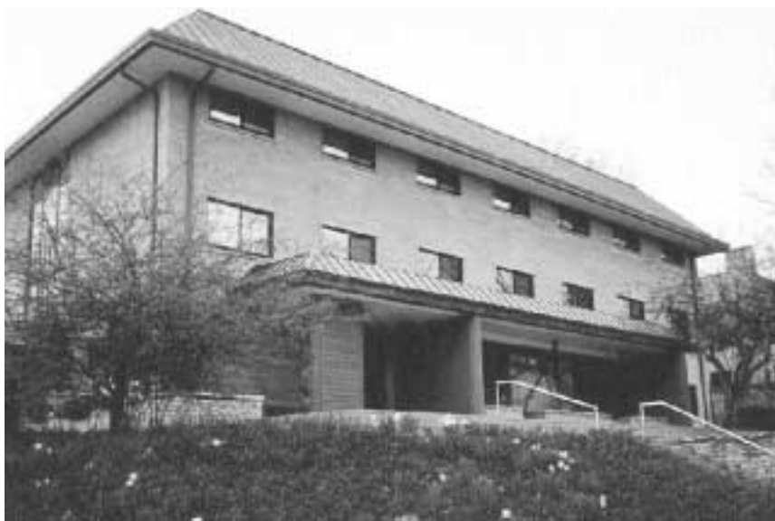
Future location of the School of Informatics, IUB

Research and theory in informatics move rapidly to application and development. The faculty teaching in the School of Informatics participate in research activities and new applications of technology. As a result, faculty can transmit state-of-the-art knowledge to their students. Indiana University is capitalizing on this great research strength in informatics at both IUB and IUPUI with the formation of an Informatics Research Institute (IRI). The Informatics Research Institute will conduct research in areas of emphases shared with the School of Informatics, including: fundamental research in human computer interaction; fundamental research in capturing, managing, analyzing, and explaining information and making it available for its myriad uses; and expanding research into policy and socioeconomic issues arising from information technology.