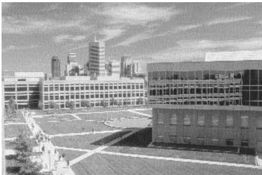
Indiana University-Purdue University Indianapolis

INDIANA UNIVERSITY BULLETIN OFFICIAL SERIES (USPS 262440) ISSN 0-888-5338