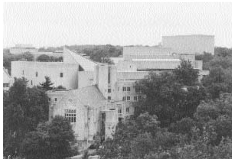
Indiana University Bloomington