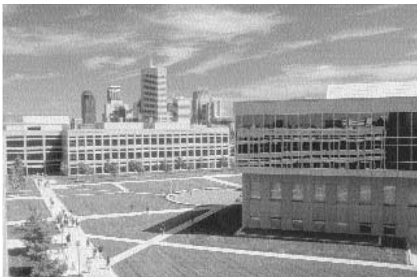
Indiana University–Purdue University Indianapolis

INDIANA UNIVERSITY BULLETIN OFFICIAL SERIES (USPS 262440) ISSN 0-888-5338